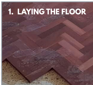
1. LAYING THE FLOOR