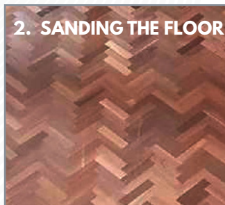
2. SANDING THE FLOOR

Timberseal is very flexible and when worked well into tongue and groove seams prevents entry of the subsequent coat of polyurethane (Monothane HS50 GLOSS) and virtually eliminate edge bonding.